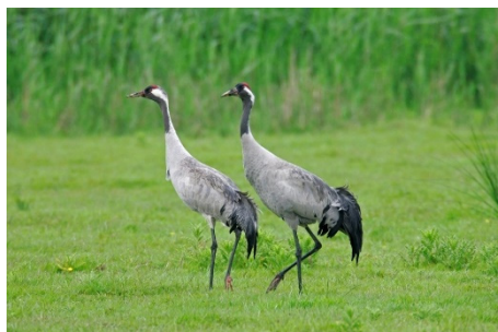
Common crane

It is a surprisingly evocative of place to revisit old field notes. Trying to decipher my scribbled species list for the Group trip to Somerset I found myself once more passing a lively rookery, then down a wooded path towards a hide where we saw kingfisher nesting in a hole in the bank opposite while a couple of dabchicks dived in the pond. This was at Slimbridge; chiffchaffs and Cetti's warblers were calling and there were barnacle geese in the Severn valley. A spoonbill was feeding metronomically in a shallow pool and watching this, I scanned the meadow beyond; how had I missed them before?; there were five cranes, the species we had been hoping to see.