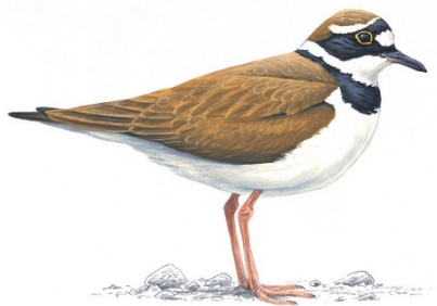
Little ringed plover

In May Leo Keedy gave an interesting talk on 'College Lake A Changing Landscape'. College Lake near Tring, a former chalk quarry and a BBOWT reserve since 1984, was landscaped to form a mosaic of habitats, including wetland, woodland, scrub, grassland, and farmland. It is part of the 'living landscape' of interconnected reserves with the upper Ray and upper Thames. The fossils found in the chalk at College Lake give the site its SSSI status. Chalk grassland flowers and butterflies, together with hobby, sandmartin, lesser whitethroat are seen in summer. Key breeding species are lapwing, redshank, oystercatcher, little ringed plover and common tern.