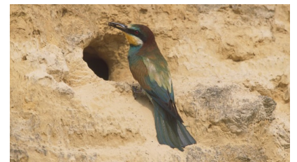
Bee eater

Seven bee-eaters have been found at a quarry in Nottinghamshire, raising hopes that they might breed. Colourful and unmistakable, bee-eaters are rare visitors to the UK and normally nest in southern Europe. The last time they nested in the UK was 2015, when two pairs set up home in a quarry in Cumbria