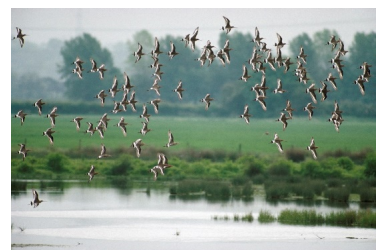
Black tailed godwits in flight .

More information can be found on their website naturebftb.co.uk and blog, currently under development.